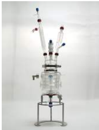
Reaction Vessel (300cc ~ 6L)