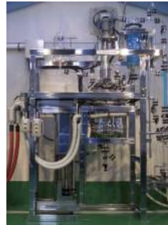
Ultra-Low Temperature Reaction Unit (20L ~ 60L)