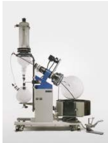
Rotary Evaporator (50, 100 and 200L)