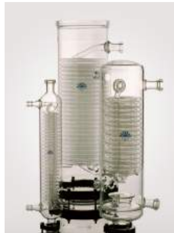
Coil Type Heat Exchanger (0.2m 2 ~ 12.0m 2 )