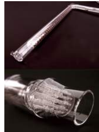
Quartz Heater & Burner (Patented)