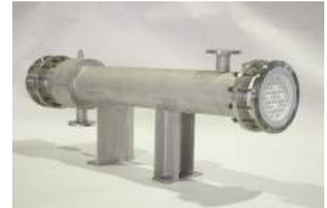
Shell and Tube Heat Exchanger (0.3m 2 ~ 100m 2 )