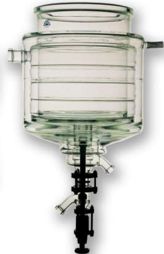
ASAHI Triple Wall Vessel 50L