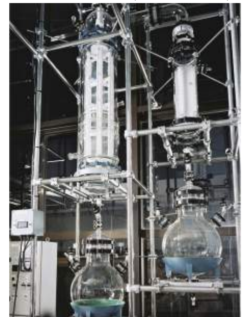
Thin Film Evaporator (0.05m 2 ~ 1.2m 2 )