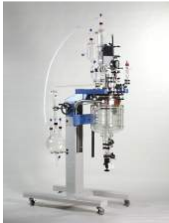
Reaction Unit (5L, 10L)

ASAHI SEISAKUSHO http://www.theglassplant.com