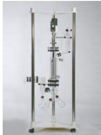
Molecular Distillation System (0.045m 2 , 0.33m 2 )