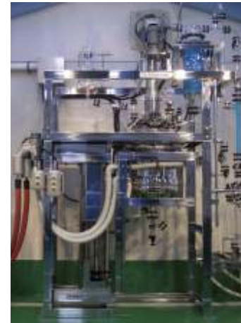
Ultra-Low Temperature Reaction Unit (20L ~ 60L)