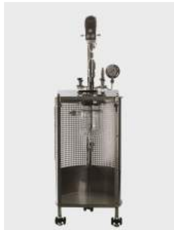
Pressure Reactor (500cc, 1L, 2L)